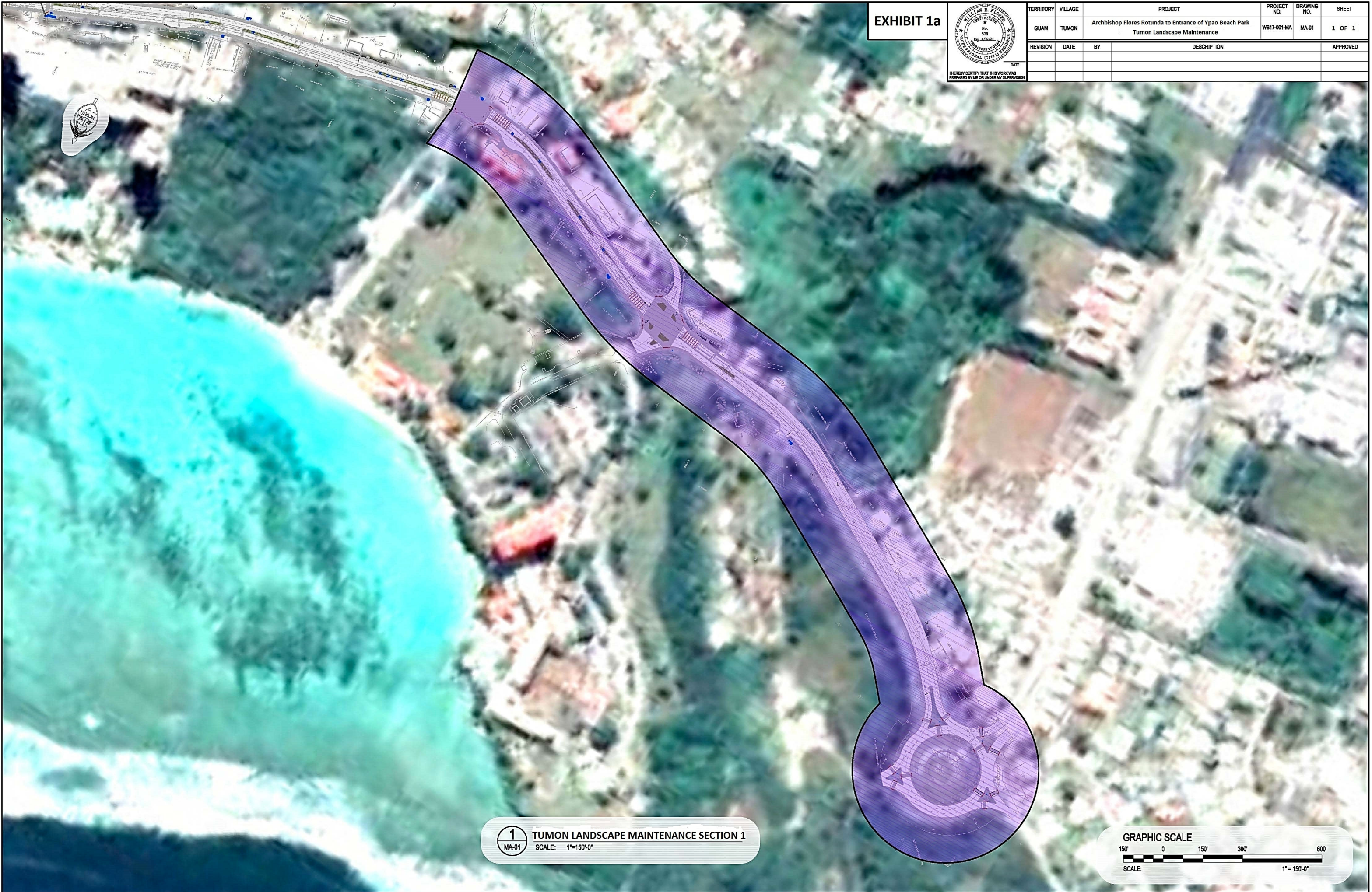
1 TUMON LANDSCAPE MAINTENANCE SECTION 1 MA-01 SCALE: 1"=150'-0"